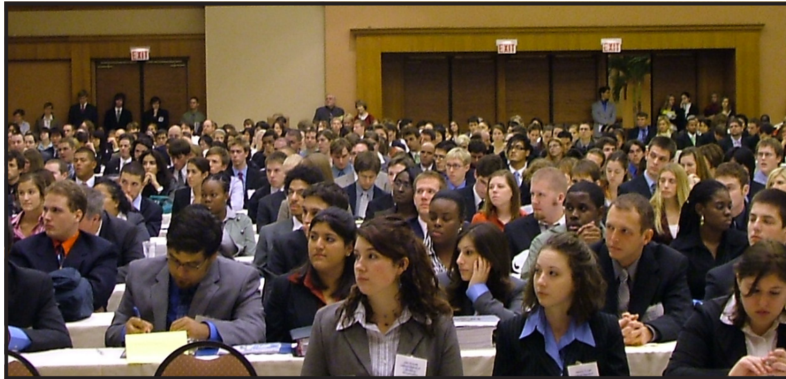
AMUN International Conference returns to the Sheraton Chicago Hotel and Towers for the 22 nd AMUN Conference. Welcome all! Now let's start changing the world.

10 The Food and Agriculture Organization is urging for swift action to be taken to stem the progress of the virus affecting the cassava plant, a staple crop of East Africa.